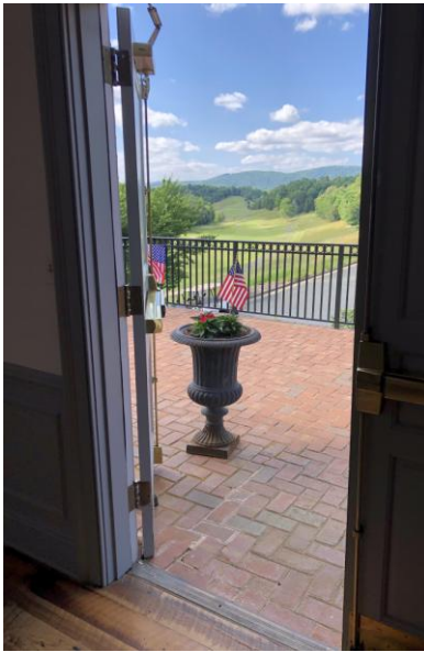
18th Fairway on Memorial Day at Club at Glenmore