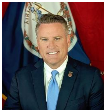
State Senator Bryce E. Reeves 28 th District