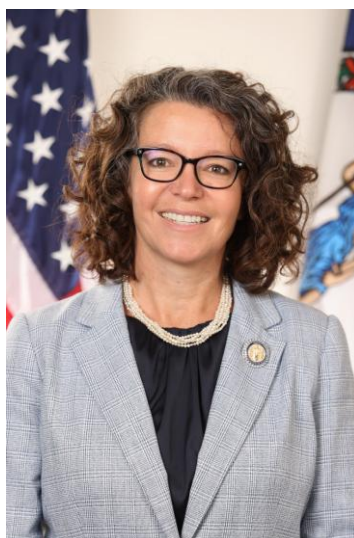
State Delegate Amy J. Laufer 55 th District (see Page 5)

Here are just a few of our Virginia legislative representatives. Check out "Who's My Legislator?" https://whosmy.virginiageneralassembly.gov/