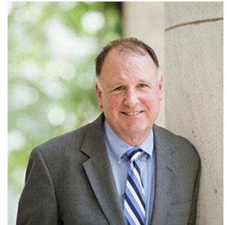
State Senator Creigh Deeds District 11