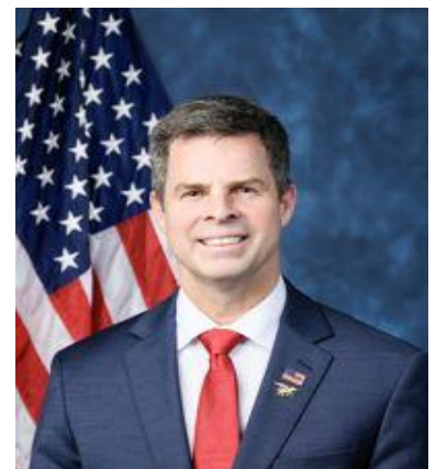
US Congressman John McGuire 5 th District