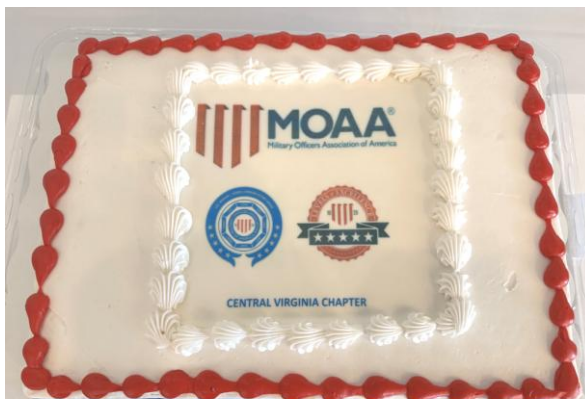
(Above) The CVC MOAA Annual Memorial Cake in honor of those that have served our nation and passed in the previous year (October 2025 to May 2026)